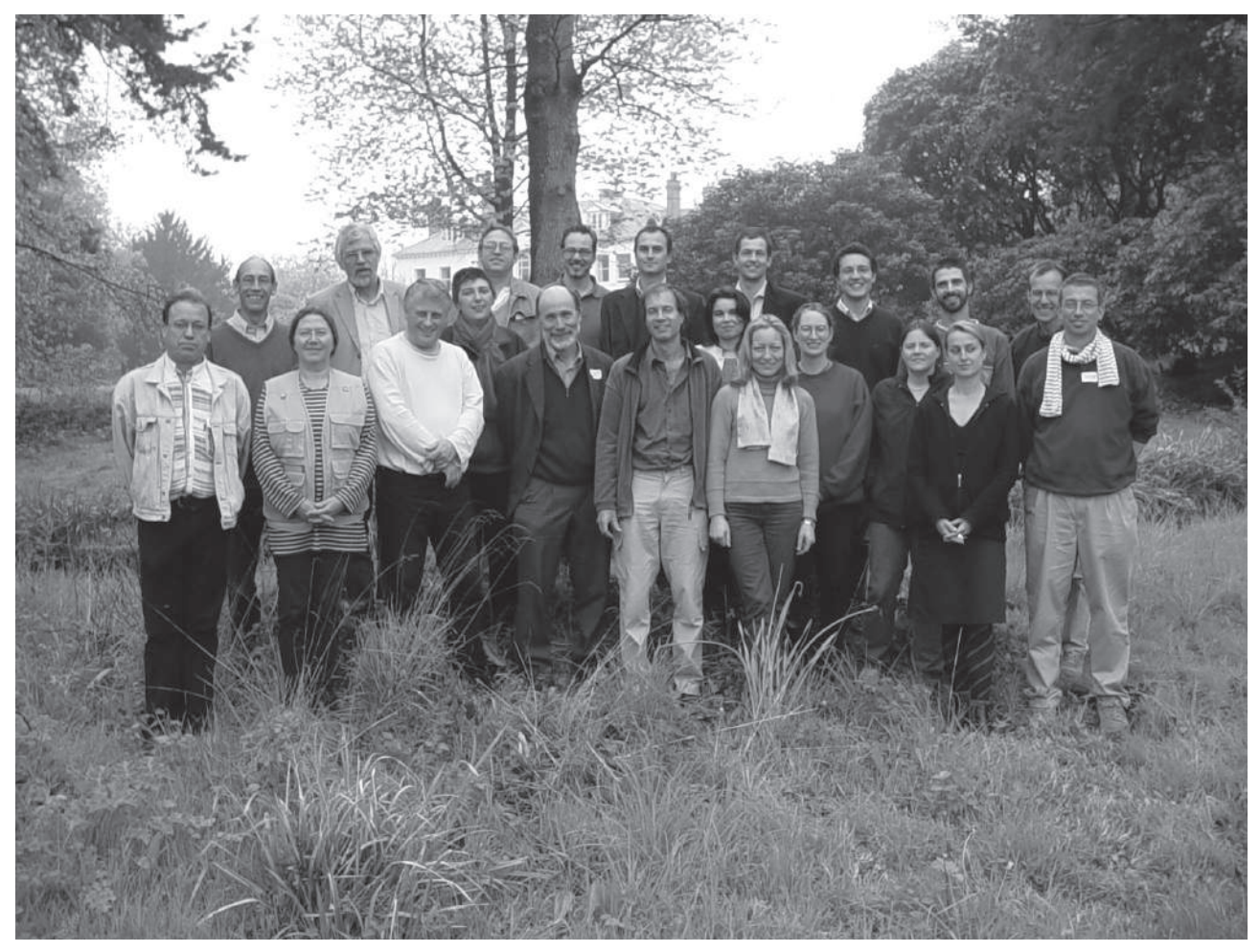
Participants of the workshop held April 29 - 30, 2004